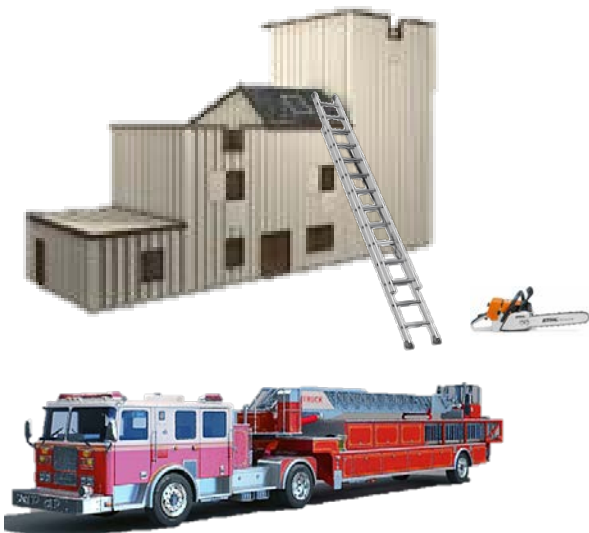
TYPICAL VENTILATION CUT "MULTI-ROLL LOUVER"